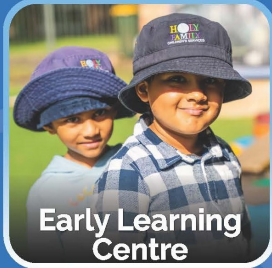
Early Learning Centre