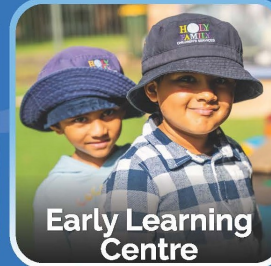
Early Learning Centre